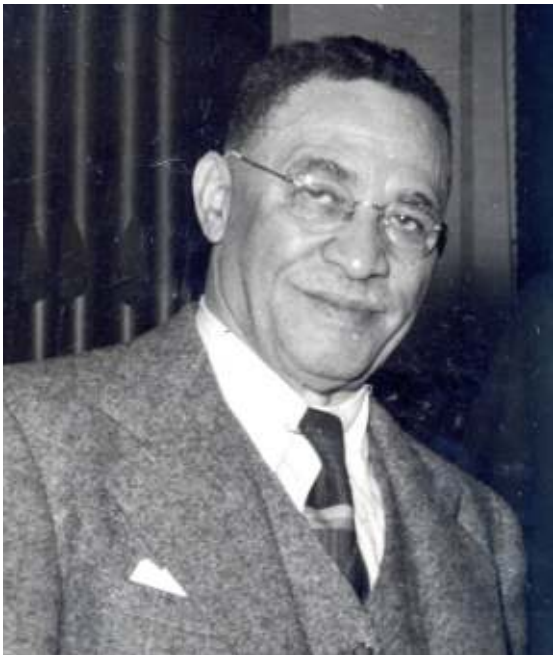
Elder Lightfoot Solomon Michaux, founder, Church of God

Read! “The Lord knoweth how to deliver the godly out of temptations, and to reserve the unjust unto the day of judgment to be punished:” The Lord knows how to deliver the Godly because