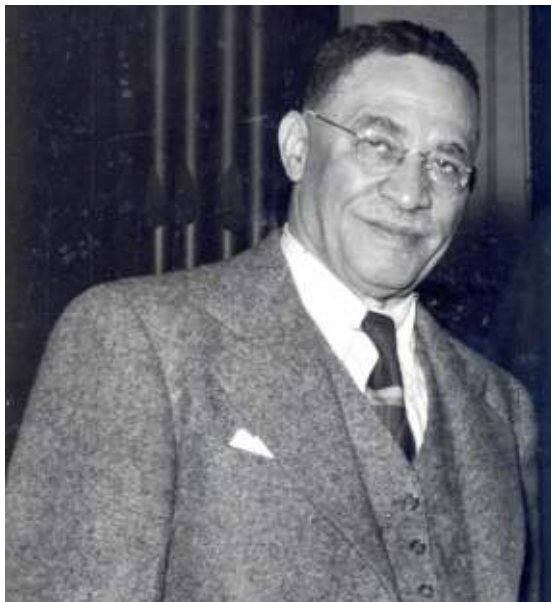
Elder Lightfoot Solomon Michaux, founder, Church of God

In St. Luke, the first chapter, reading from the 26 th to the 35 th verse inclusive, you’ll find out how the Word of God was made flesh. The Angel