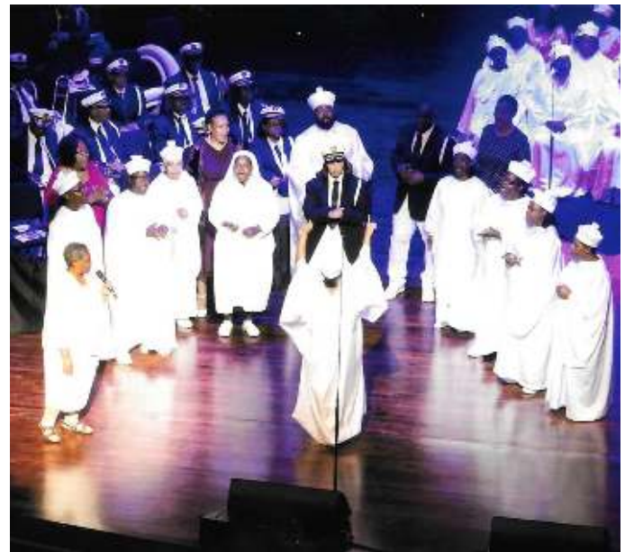
Tidewater Community Choir