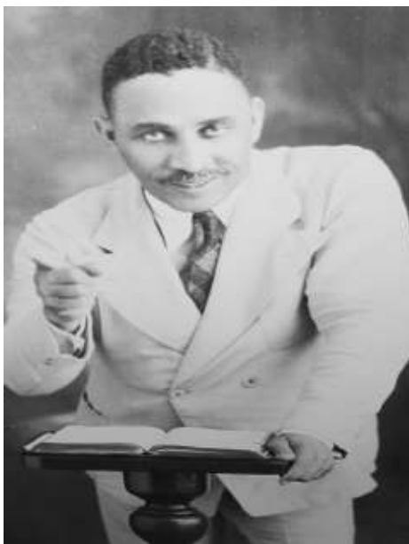
Elder Lightfoot Solomon Michaux, founder

You may go down on Broadway at any time that you want to where Negroes can go to any theatre or hotel or public place they want to, but because no law is enforced to try to make them stay in Harlem, they stay there. Now you can't find one hundred people of color on Broadway hardly through the day. You will only see a very few of them in the theatres down there. But in Washington, DC, we segregate. A notable gentleman