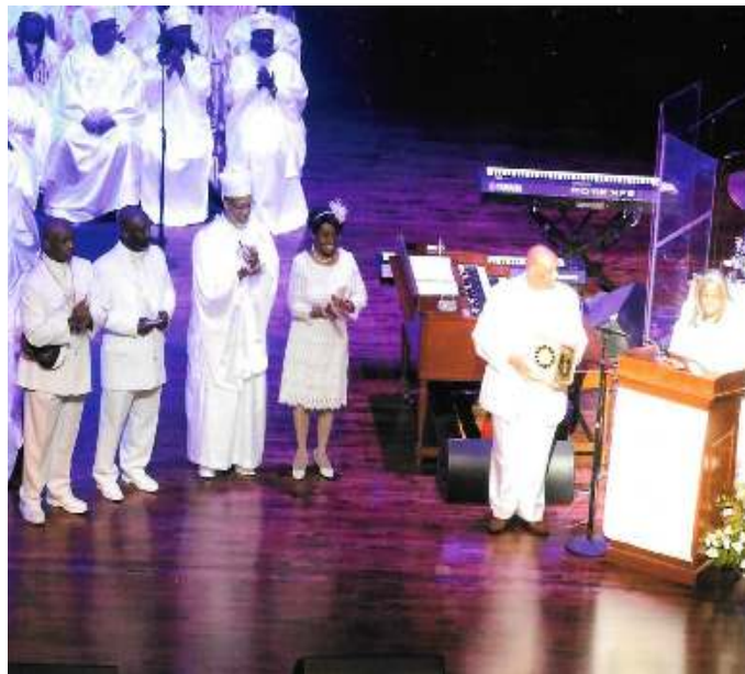
“Happy Am I” Cross Choir and Band Directors over the years receive Awards