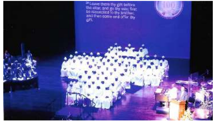
“Happy Am I” Reunion Cross Choir