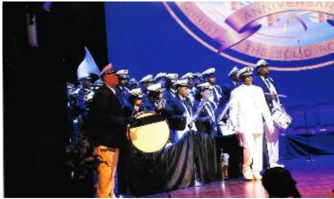
“Happy Am I” Reunion Band

Sunday..... 1:00 AM - 1:30 AM 3:00 PM - 3:30 PM 9:00 PM - 9:30 PM Monday..... 1:00 AM - 1:30 AM Saturday..... 11:00 AM-11:30 AM