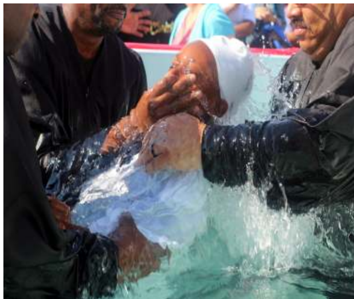
“...In the name of the Father, the Son and Holy Ghost, I Baptise thee”