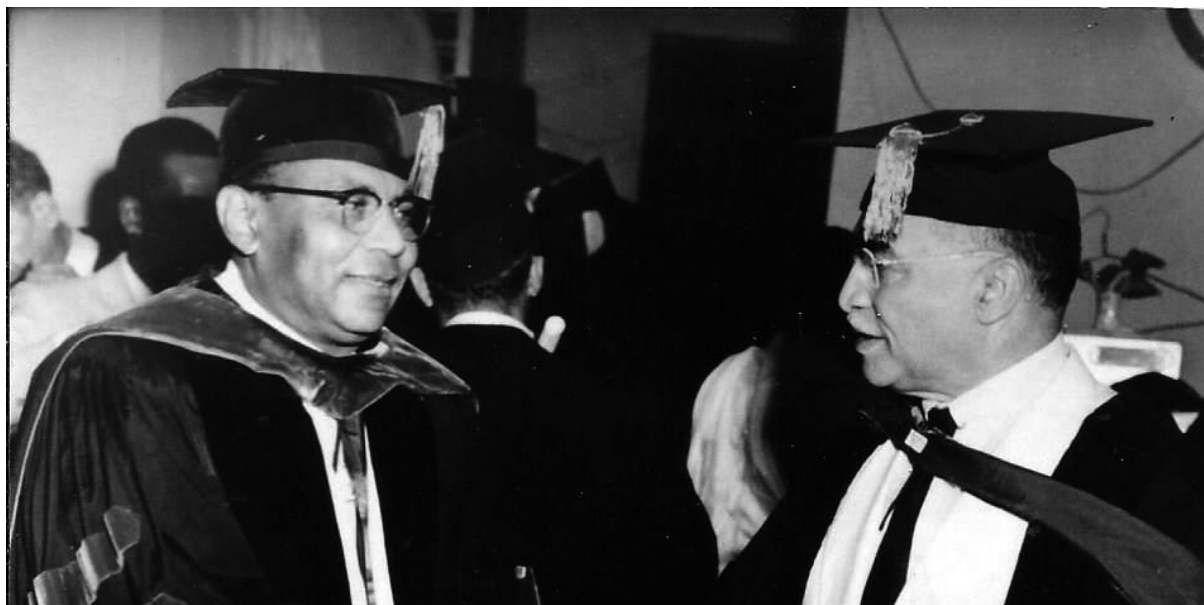
Elder Lightfoot Solomon Michaux on the right