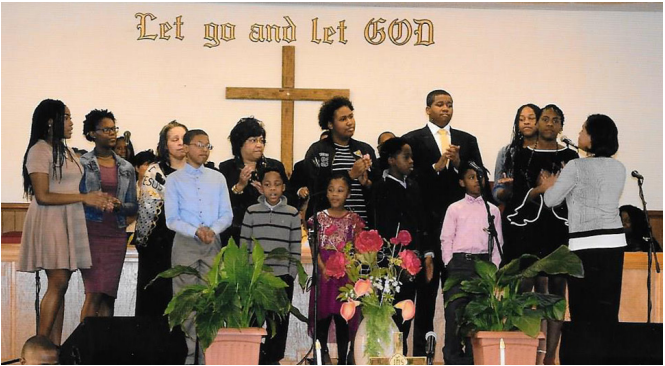
God’s Chosen Voice