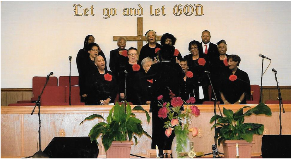
Spiritual Voices – Church of God – Baltimore Md