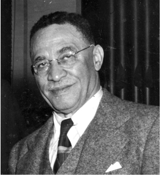
Elder Lightfoot Solomon Michaux, founder