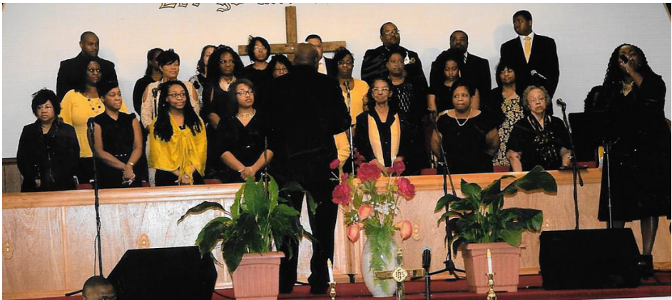
Combined Voices Choir

Church of God 300 Lincoln Street Hampton, Virginia