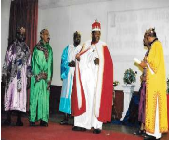
Easter Play Continued on Page 7