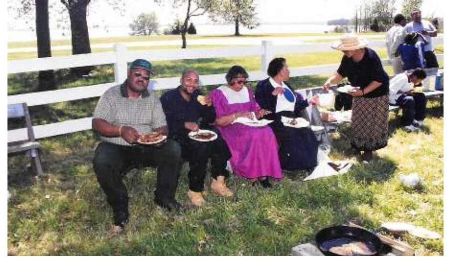
Annual Commemoration Service and Fish Fry