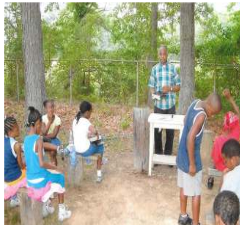
Camp Lightfoot Continued on Page 4