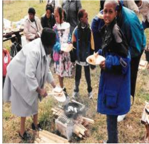
Commemorative Service Continued on Page 6