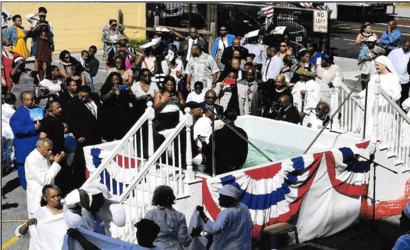
I Baptise You ...