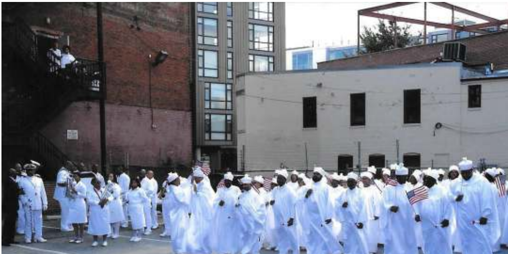
Cross Choir and Band Gathering to March