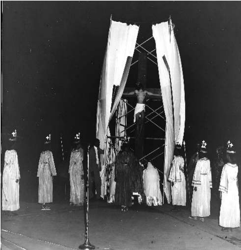
Pageant- Griffith Stadium-1950