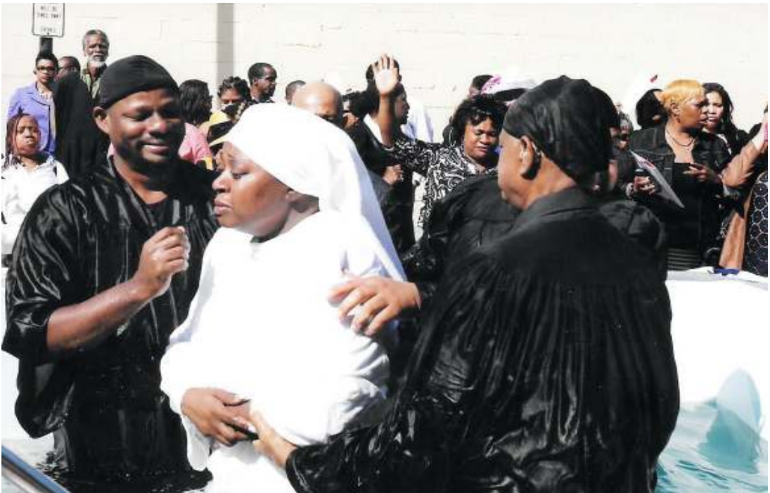
In the name of The Father, Son and Holy Ghost