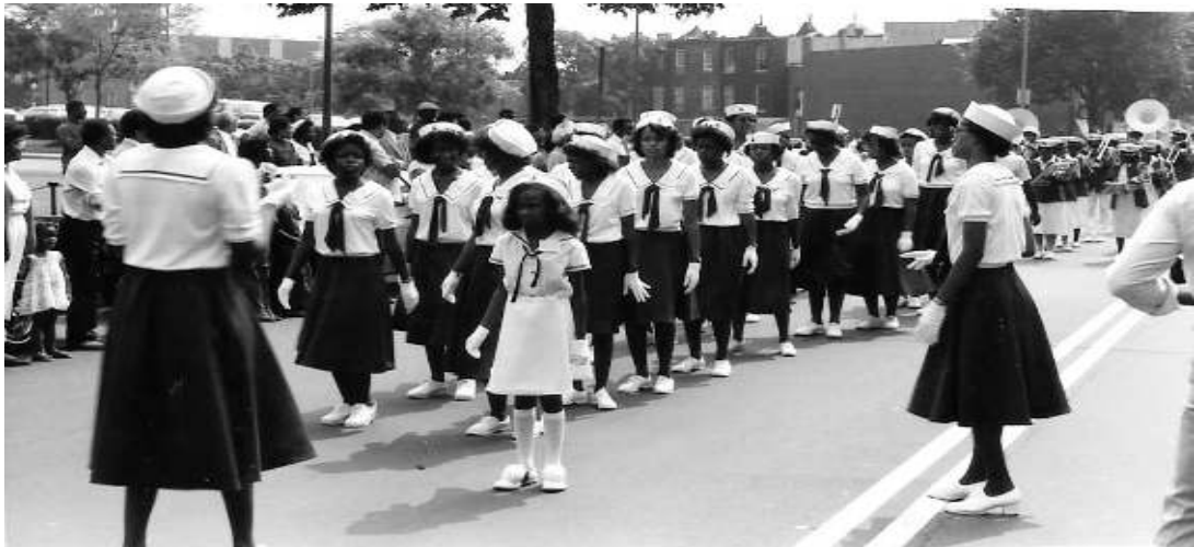
Tour Guides and band 1980’s

“There is one body, and one spirit, even as ye are called in one hope of your calling: one Lord, one faith, one baptism” (Ephesians 4:4,5).