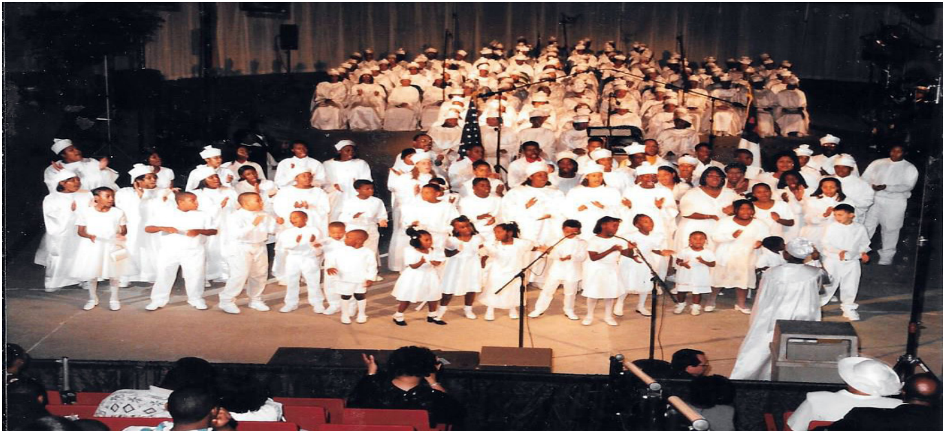
Church of God Youth Choir