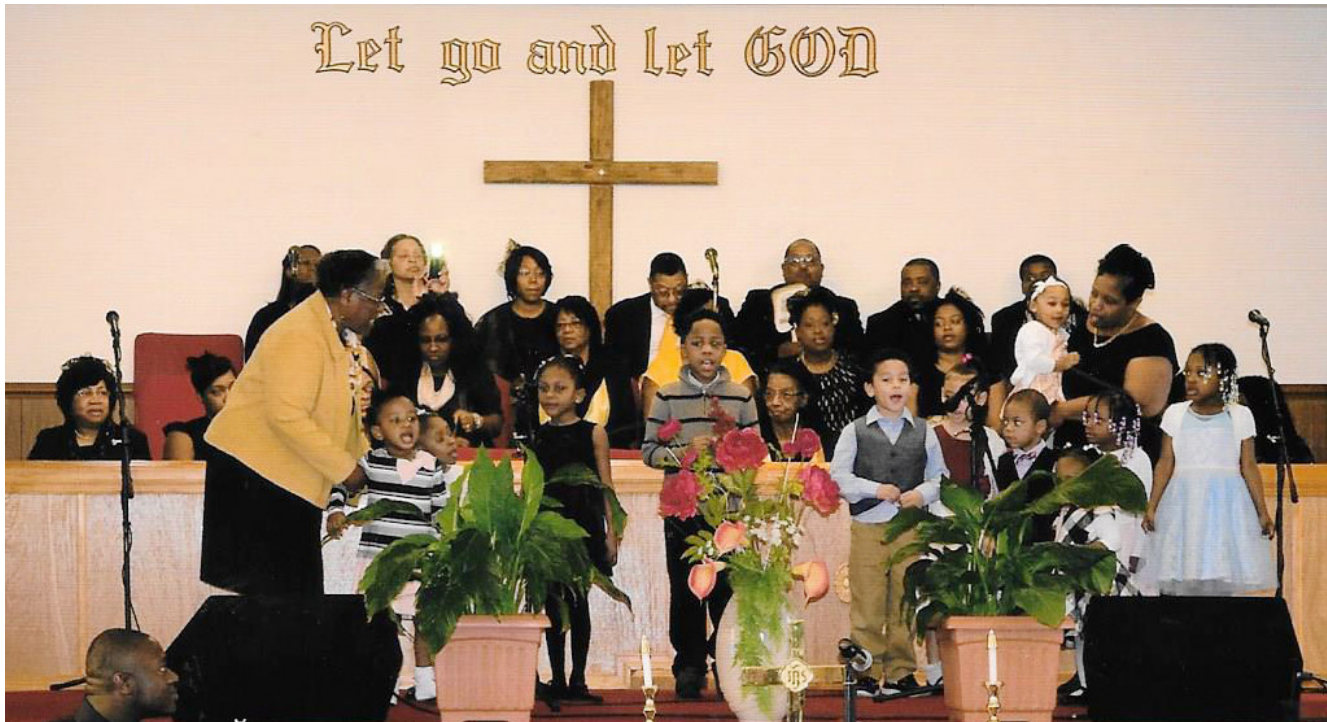
Choir Day - Children's Choir